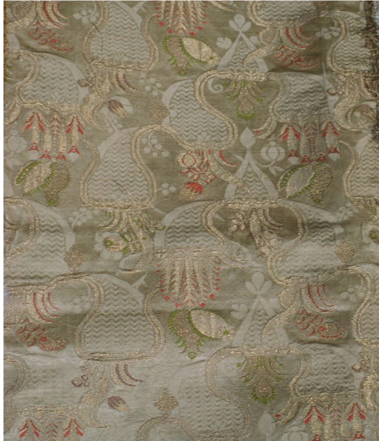
Figure 6. Detail of a damask brocade chasuble, Lyon?, France, about 1710

One possible solution to this complex problem might consist in defining a geographical area in terms of its culture and history, and subsequently collecting its textiles together in one unique place (a warehouse, a workshop, a library, an exhibition room). Here, the textiles would not only be conserved according to appropriate criteria, but their value would be enhanced, as a result of their being studied and exhibited. Such criteria is the basis for the project “ Centro Ossolano di Conservazione e Studio dei Tessuti Antichi ” (a centre for the conservation and study of antique textiles), underway in the village of Baceno in the Antigorio valley (Northwest Piedmont). The Centre is to be hosted in the ex-primary school in Croveo (a hamlet district of the village), which has the architectural qualities and characteristics that make it ideal for the purpose. The objective of the Centre would be to promote the cultural and social aspects of the community, creating public meeting and job opportunities by putting to good use the area’s resources and history.