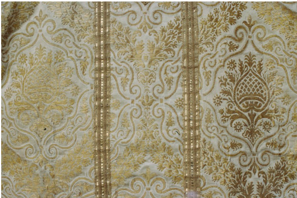
Figure 4. Detail of a damask brocade chasuble, Milan, Italy, first half of Seventeenth Century