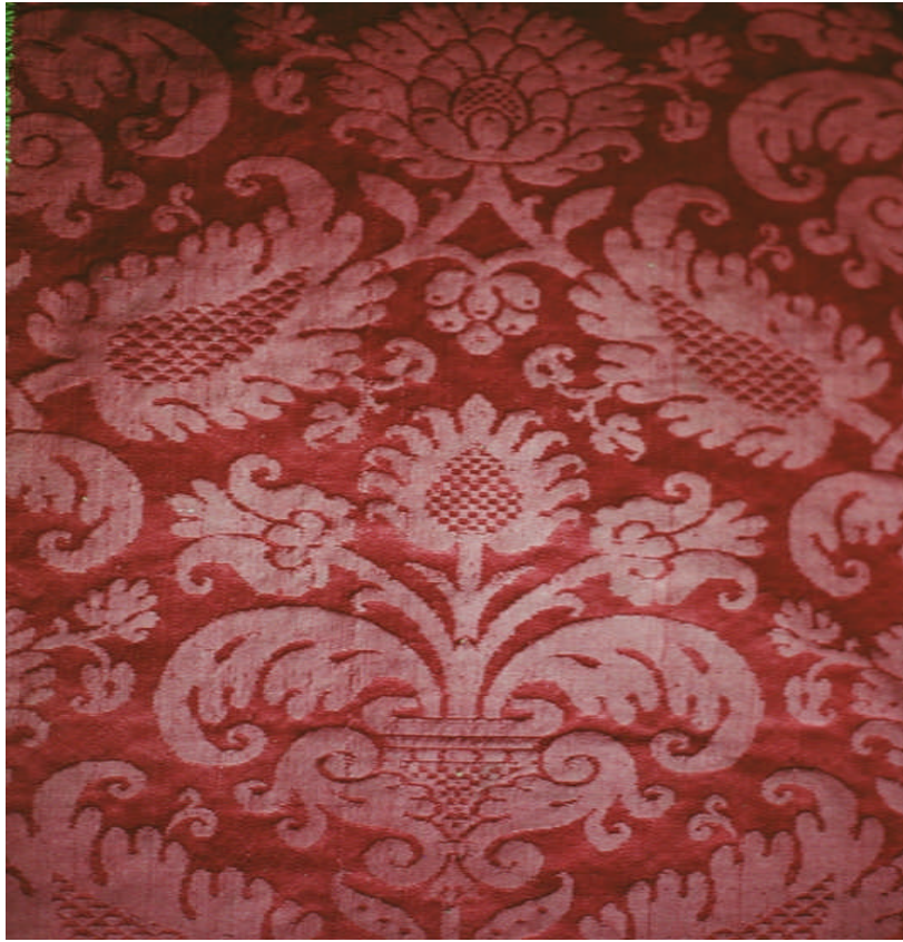
Figure 3. Detail of a damask chasuble, Milan, Italy, first half of Seventeenth Century