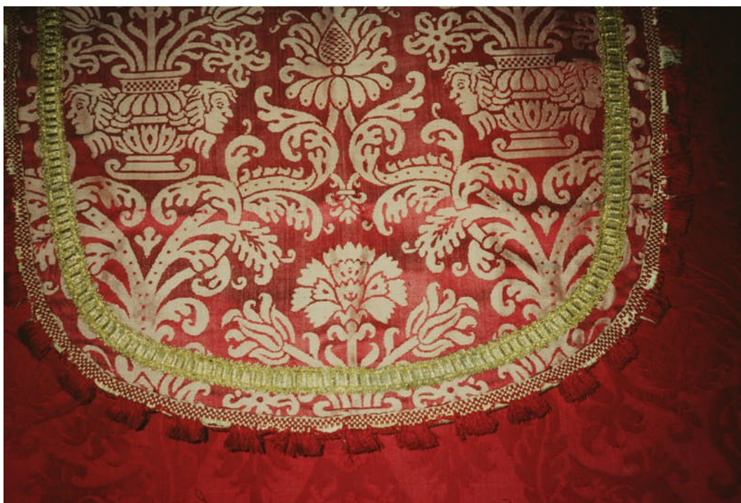
Figure 2. Detail of a damask cope, Milan, Italy, first half of Seventeenth Century

The Alpine valleys of Northern Piedmont belonged to the Duchy of Milan in the 17th century and textiles were purchased from merchants who worked for the capital's silk factories (fig. 2-4) 3 .