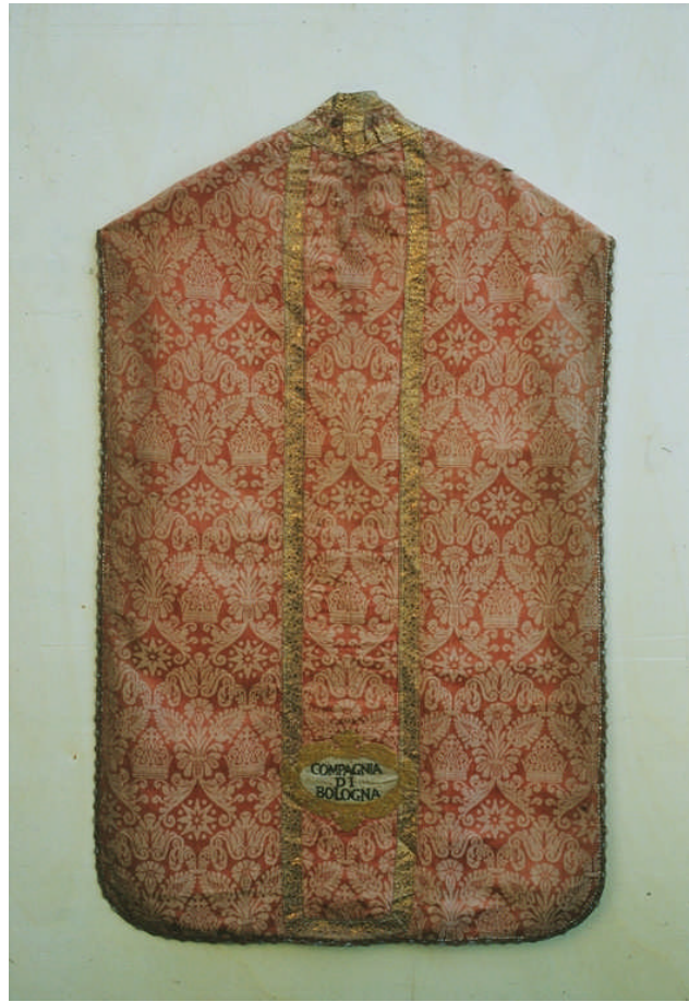
Figure 5. Damask chasuble, Bologna, Italy, first half of Seventeenth Century

Although the inventories have been beneficial in revealing the heritage of antique textiles kept still to this day in Alpine churches, conservation is still an unresolved and pressing issue. This is a heritage that is highly vulnerable, not only as a result of theft, but also due to deterioration caused by misuse. The depopulation of the mountains has led to an almost total closure of hamlet chapels and occasionally of parish churches. The case of Maria Vergine Assunta church in Salecchio (Premia) is typical. In this church, located in the heart of what is today a ghost village, a precious corpus of sacred vestments has been uncovered (fig. 6).