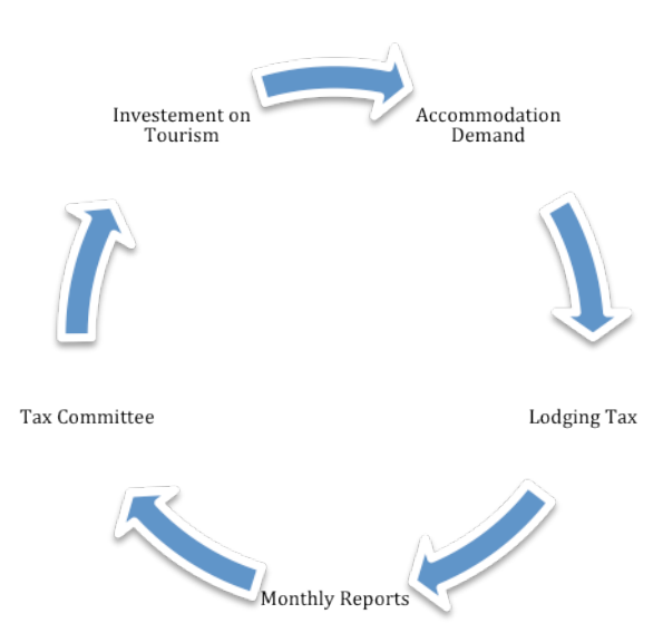
Figure 1. City tax cycle of development